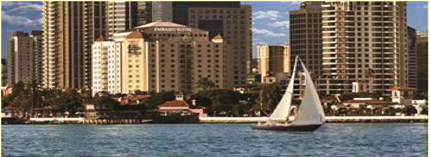
Site of 2015 NERO Conference

Plan on joining us for our 23rd Annual Conference and Training; NERO's 23rd Annual Conference and Training Seminar will be February 15-18, 2015 in San Diego, CA at the Embassy Suites San Diego Bay-Downtown. Please make hotel reservations for our conference in San Diego by calling 619-239-2400 ext. 1 when you call please let them know you are with the National Egg Regulatory Officials. We have rooms blocked out for the nights of February 14-19, 2015. Reservation deadline is January 24, 2015! More information on NERO can be found on our website at www.nerous.org